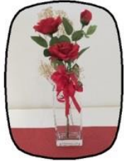
Presidential Chapter Achievement Award